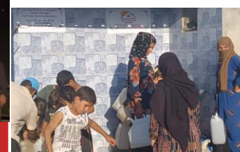
Drilling of water wells in Rojava...