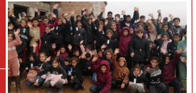
Distribution of coats to children in Rojava...