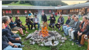
Summer and winter chalet camps, Switzerland