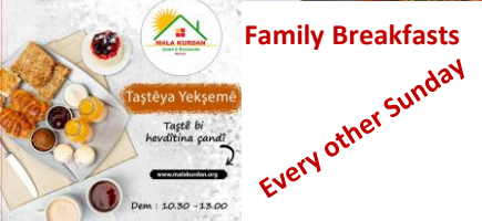
Every other Sunday