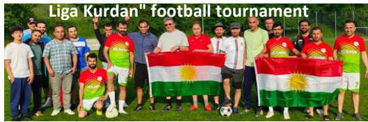
"Liga Kurdan" football tournament