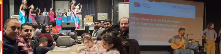
Participated in the Fête de la Diversité Festival in Lausanne.