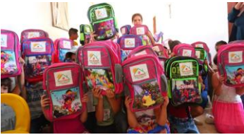
Distribution of school bags to children in Rojava...