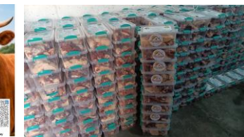
Distribution of Qurban meat to families in Rojava